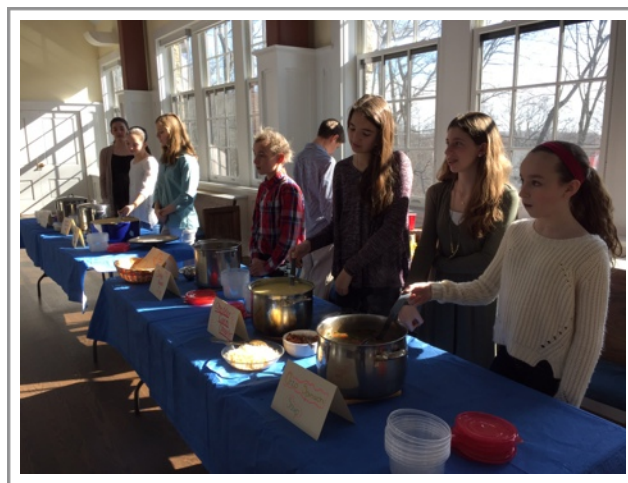
Confirmation class on Souper Bowl Sunday

The confirmation class held a successful soup tasting fund-raiser at coffee hour on Feb. 7 th . They made six different soups to taste and purchase. On Tuesday, Feb. 9 th confirmation students cooked pancakes and sausages at the annual Shrove Tuesday pancake supper. A total of $284.07 was collected for the Food Bank Network of Somerset County.