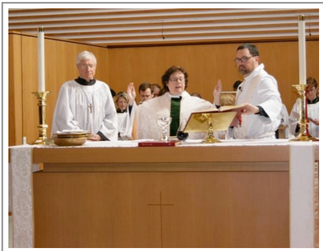
The Rectors of St. Mark's Basking Ridge and St. John on the Mountain celebrating Holy Communion together.

You will hear more about our High Holy Days as they draw nearer, but please plan on sharing them with us!